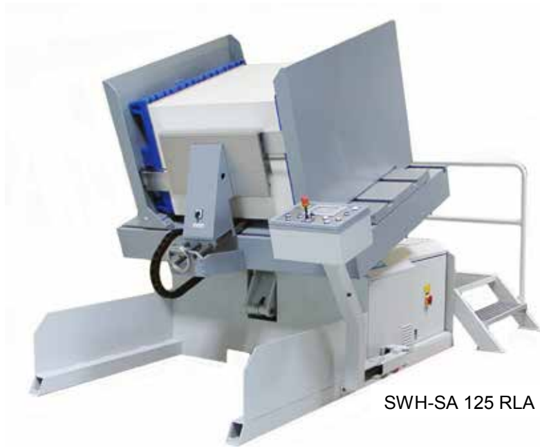
SWH-SA 125 RLA (175)

SPEEDTURNER® - powerful and efficient - For turning, airing, aligning, jogging and transferring piles onto special pallets